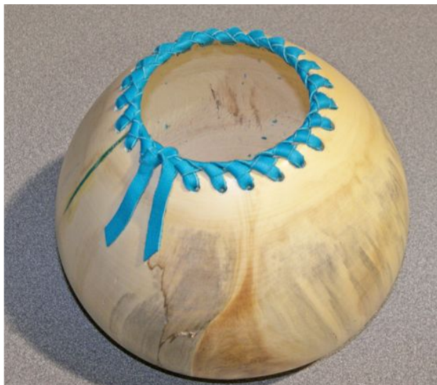
aspen bowl with leather lacing